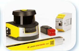
RSL, MLC - Product for safety at work

In recent years, Leuze has been investing in leading technologies on robust industrial communication for smart factory applications.