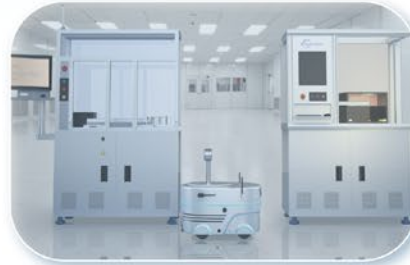
Real Time Detection, Real Time Response

A local tech SME – Powered by Artificial Intelligence, Driven by Innovation