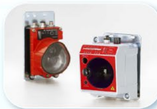
DDL500 – Product for Optical Data Transmission

We are primarily targeting industries in which we have in-depth, specific application know-how and many years of experience. These include intralogistics and the packaging industry, machine tools, the automotive industry as well as laboratory automation.