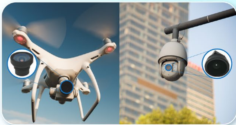
Plastic & Glass Molded Lens

For decades, the manufacturing processes of optical lenses have been time-consuming, energy-intensive, expensive and optical lenses of complex specifications are challenging to produce in volume. Precision Mold processing technology such as Injection and Glass Molding from Wavelength Opto-Electronic is a flexible manufacturing solution addressing all the above issues. When the low-cost, fast, efficient and high volume production of optical lenses are requisite, this cutting-edge technology has replaced the need for old manufacturing techniques.