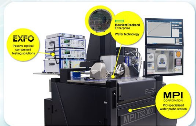
EXFO PIC testing collaboration with HPE and MPI

Through memberships in consortiums including LUX Photonics, EXFO has already joined forces with multiple vendors to create integrated solutions in PIC testing such as these recent collaborations: