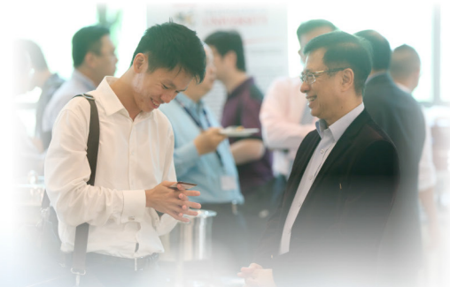
The 16-17 February event succeeded in bringing together researchers and industry professionals, opening up new possibilities for collaboration.